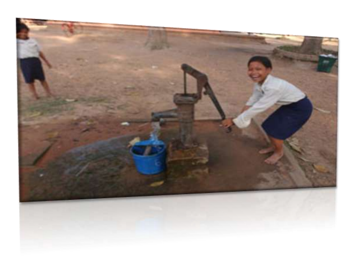
Because of your investment in Friends of CCDO, 16,000 people were able to access clean water.